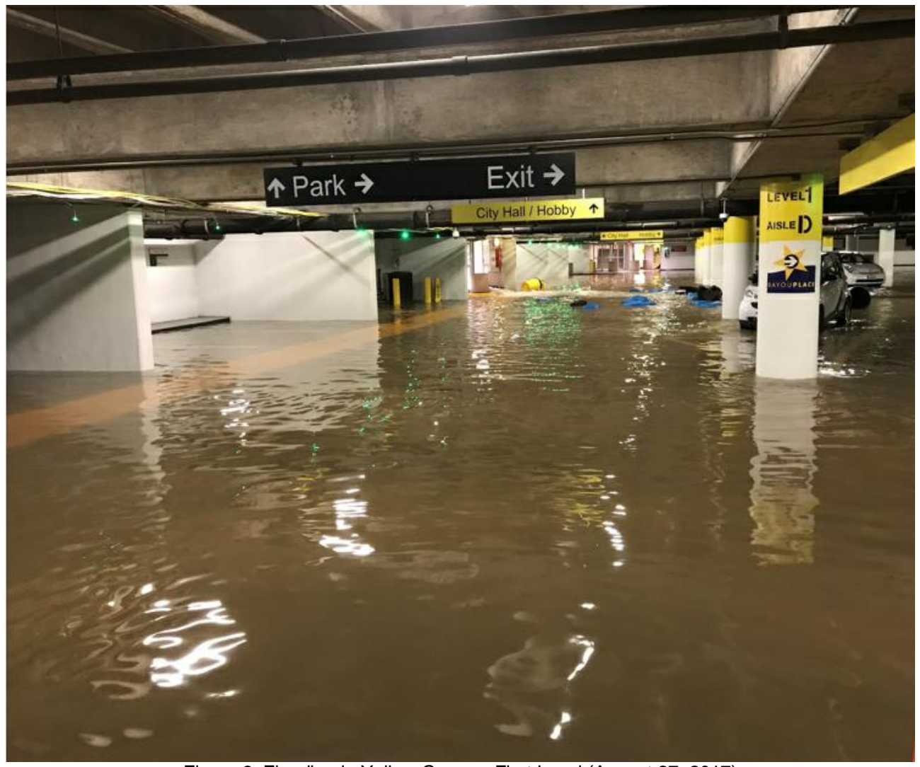
Figure 3. Flooding in Yellow Garage, First Level (August 27, 2017)

From the date issued until the Submission Deadline, Proposers are directed not to communicate with any HFC officer, director, employee, agent, or contractor regarding any matter relating to this Proposal, other than through <a href="mailto:bids@houstonfirst.com">bids@houstonfirst.com</a>, HFC representatives during the Pre-Proposal Meeting and Site Tour, or as authorized in advance by HFC's General Counsel. HFC reserves the right to reject any Proposal due to violation of this provision. Proposers represent that the contents of their Proposals have not been communicated, directly or indirectly, to any potential Proposer, and that their submissions are made in compliance with federal and state antitrust laws without previous understanding, agreement or connection with any competitor or other potential Proposer.