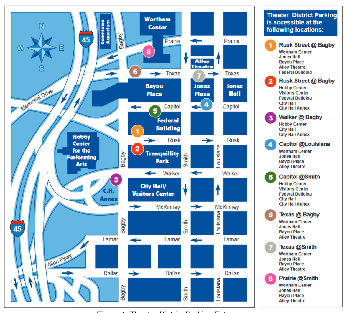
Figure 1. Theater District Parking Entrances

Data connectivity will be provided in intermediate distribution frame (IDF) rooms in the Facility; the Contractor selected will be required to install pathway and cable from such rooms to locations needed by the PARCS. Electrical power and infrastructure will be installed by HFC's contractor.