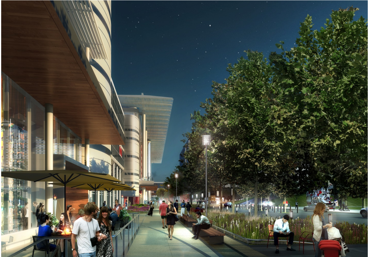
Rendered image of the northern end of the new plaza reflecting the new front door of the Convention Center and enhanced pedestrian areas.